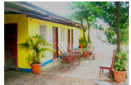
A 'hospedaje' in San Francisco Libre

Specialist tours of birdwatchers, or music lovers could be developed. Also, SFL's location on the shore of the magnificent lake Xolotlán opens the possibilities of boat trips to explore nearby volcanic islands.