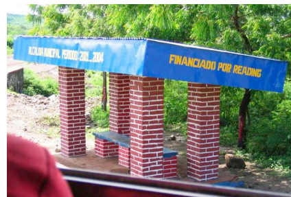
Viewed from the bus: SFL bus shelter 'financiado por Reading'

A sturdily built brick and corrugated iron example now stands on the edge of town, sheltering passengers from the fierce sun and torrential rains.